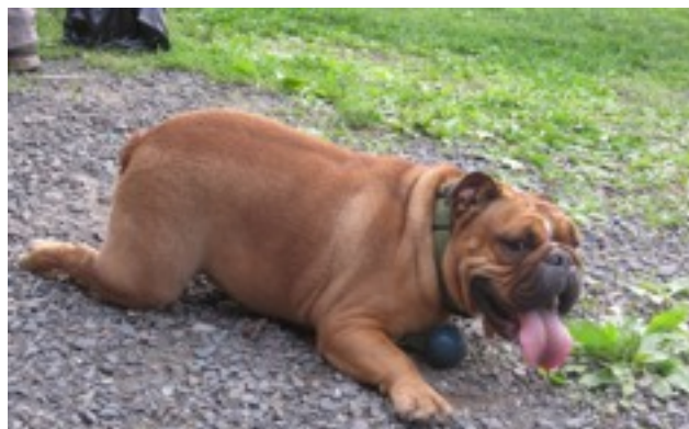
Where's the... Beef, more of a distance runner than a sprinter