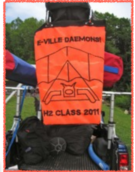
Left: Red-eyed glider gryphon; Top: Signal flag declares the H 2 alliance with the forces of E-ville!