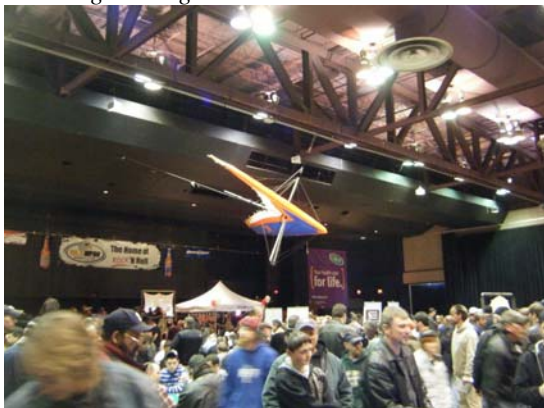
Hang Gliding Showcased at the Man Show