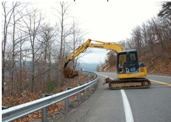
Dump the Stump!

Then on November 21/22 & 29 large parties of volunteers made significant progress on improving the entrance to the access road. First the culvert was cleared out. Then there was a brief delay to extract the giant gravel truck from the soft ground it had sunken into overnight. A combination of human and machine power finally freed the trapped truck.