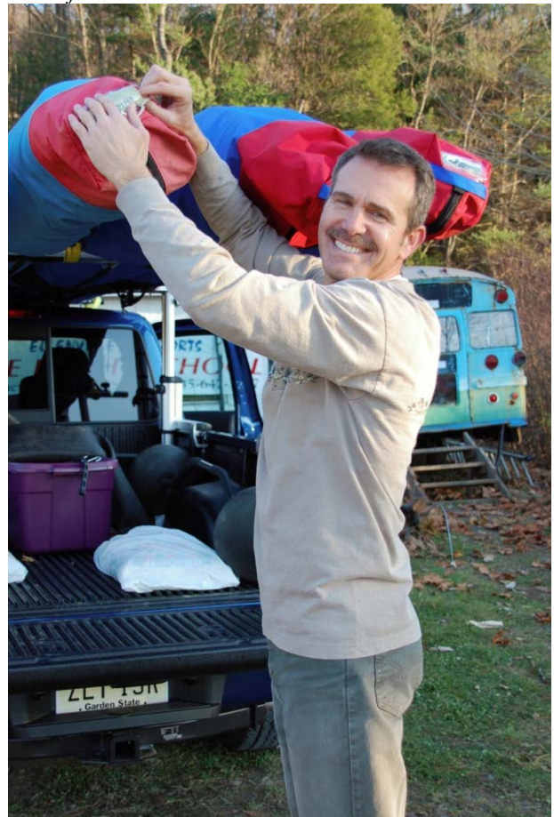
Carl of the Corn

thought I was south of launch. 2) I also did not pay close enough attention to my altitude in relation to the terrain. Never focused on some target to determine if I was sinking. When I realized I was way off target for the LZ I headed towards it. I thought all was ok then the trees seemed to be too close for comfort although I thought I could still pull it off. All of a sudden I was pushed out of the sky as I described it to Tom Galvin. When that happened I looked for a clearing in the corn field and safely landed. Tips to pass on: Always have cell phone numbers of the other pilots you are hang gliding with in case you do have to make an alternate landing, so they can locate you; also have a radio with two-way communication capability set to the common frequency.