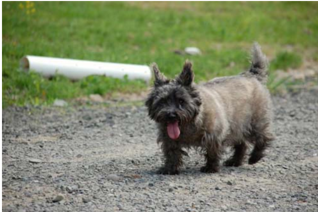
The Grand Old Man – Scotty!