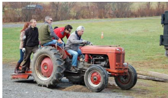
Mountain Wings Tractor Pull

Then on November 21/22 & 29 large parties of volunteers made significant progress on improving the entrance to the access road. First the culvert was cleared out. Then there was a brief delay to extract the giant gravel truck from the soft ground it had sunken into overnight. A combination of human and machine power finally freed the trapped truck.